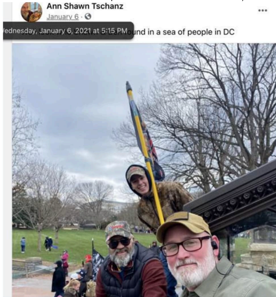
[Daily Beast, 6/27/21 ]

that was inside a restricted area. (The Daily Beast recreated the photo on Friday and confirmed that Van Orden would have had to cross police barricades to reach that area.)”