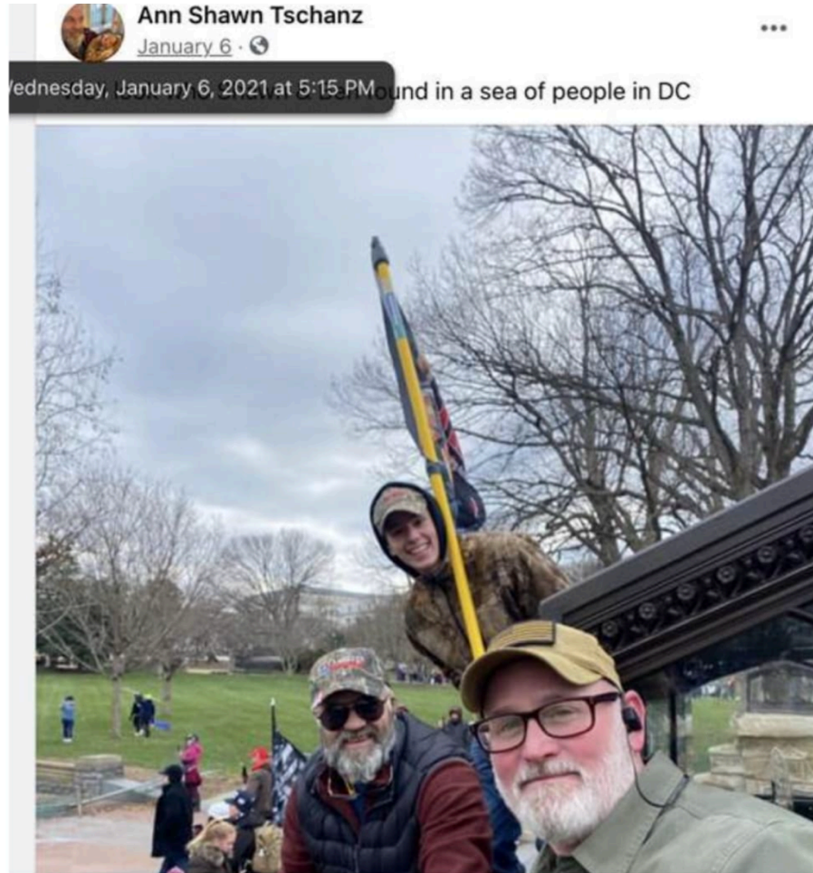
[Daily Beast, 6/27/21 ]

Orden would have had to cross police barricades to reach that area.)”